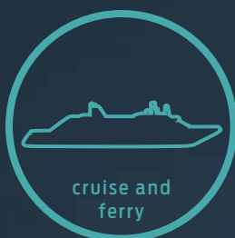
cruise and ferry