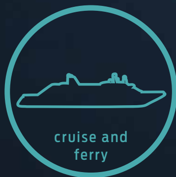
cruise and ferry