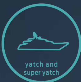
yatch and super yatch